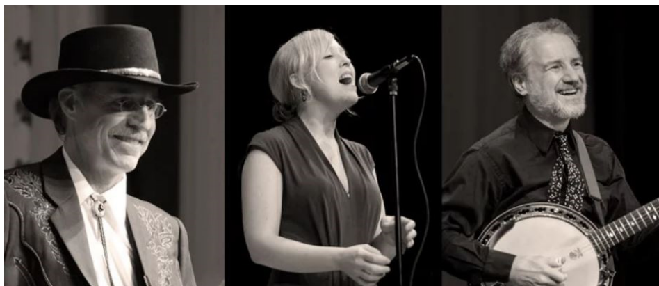
The Honey Pies