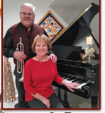
Ivory & Brass